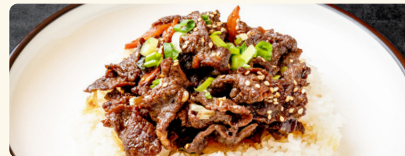
韩式烤肉盖饭 KOREAN BBQ WITH RICE 14.50 Beef, carrots, onions and green onions