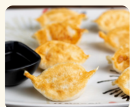
三鲜蒸饺/煎饺 SHRIMP AND PORK DUMPLINGS 13.80 Ground pork, Chinese chives and shrimp (8 pcs) *Pan-Fried option available + $0.5