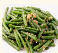
干煸四季豆 GARLIC STRING BEANS 11.80 String beans, dried radish, and garlic