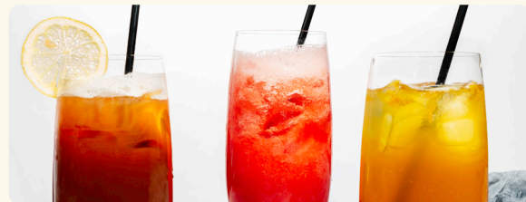
百香果绿茶 PASSION FRUIT GREEN TEA 5.50