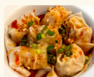
鸡肉抄手 CHICKEN SPICY WONTONS 8.80 Chicken Wonton with house-made spicy sauce (6 each)