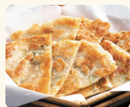
葱油饼 SCALLION PANCAKE 7.80 Crispy pan-fried flour pancakes with green onions (8 pcs)