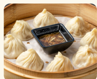
多汁小笼包 JUICY PORK BUNS 13.80 Ground Pork (8 pcs)