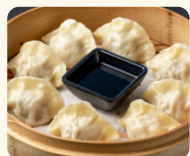
白菜猪肉蒸饺/煎饺 PORK CABBAGE DUMPLINGS 13.80 Pork and cabbage (8 pcs) *Pan-fried option available + $0.5