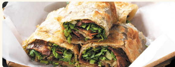
牛肉卷饼 BEEF ROLL PANCAKE 12.88 Beef, green onions, cilantro and hoisin sauce (4 pcs)